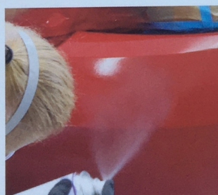
Apply SprayMax UV Spot Blender 5680091 as required through the transition area and allow to flash approximately 1 min. prior to curing with lamp.