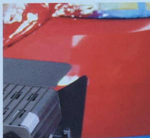
Cure repaired area for 2-4 min. depending on curing equipment (see TDS for details).