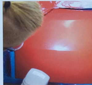
After complete curing wet sand and polish as required.