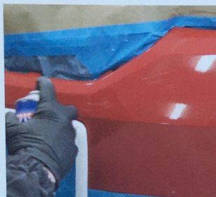
Wash with soap and water then clean surface generously with SprayMax Solvent Wash 3680090