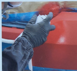
Clean surface with SprayMax Wax & Grease Remover 3680094, wipe with tack cloth, then apply basecoat to obtain adequate hiding.