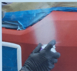
Use SprayMax UV Primer Cleaner 5680290 to remove residue prior to sanding.