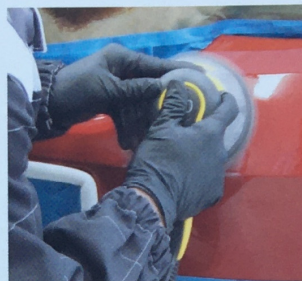
Sand damaged area using P320. Clean with SprayMax Wax & Grease Remover 3680094 then apply SprayMax Adhesion Promoter 3680009