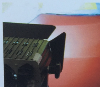
Cure SprayMax UV Primer 5680019 for 2-4 mins. depending on curing equipment (see TDS for details).