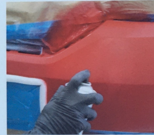
Tack surface prior to applying 1-2 coats of SprayMax UV Clear 5680059 allowing a minimum of 1 min. flash time between coats.