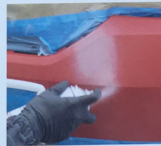
Shake SprayMax UV Primer 5680019 for 2 min. then apply 1-2 coats. Allow 1 min. flash time between coats.